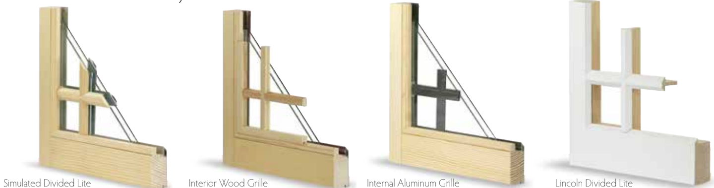
Simulated Divided Lite

We offer four convenient styles of lites for staying historically accurate, making a statement or easy cleaning. Lincoln Divided Lite (true divided lite) available for Primed and All Wood exteriors only.